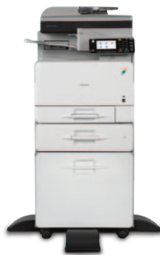
MP C305 with optional PB1050 Paper Tray