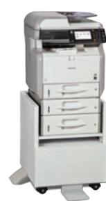
Standard Tray with one 250 and one 500 Sheet Tray