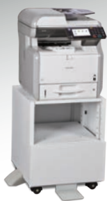
Standard 500 Sheet Tray