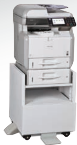
Standard Tray with one 500 Sheet Tray