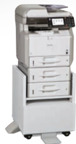
Standard Tray with two 500 Sheet Trays